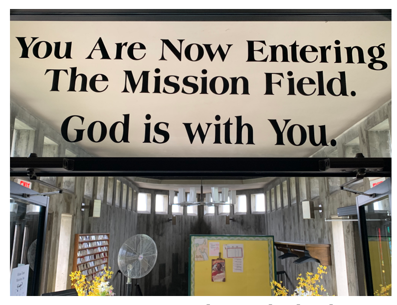
Message as one is leaving the church

We value our faithful church community. Far more unites us than divides us. Instead of enabling divisiveness and polarization, we wish to foster our common love for this community that stems from the strength of Jesus and his teachings.