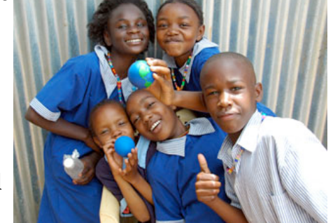
Mother's Mercy Children

St. Thomas joyfully takes to heart our responsibilities for the physical and spiritual needs of others.