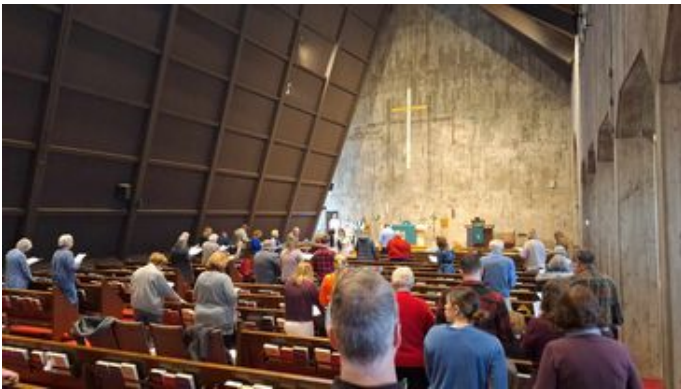
Sunday 10am service

Sundays bring an opportunity to worship together using either Rite 1 at 8am (no music) or Rite 2 at 10am with choir and music. We approach liturgy from a broad church perspective. Adult Education, Children's Sunday School and Film School for our teens occur between the services. Coffee hour follows the 10am service. After services, our youth may then be off for a fun activity or service work with our associate priest/youth minister.