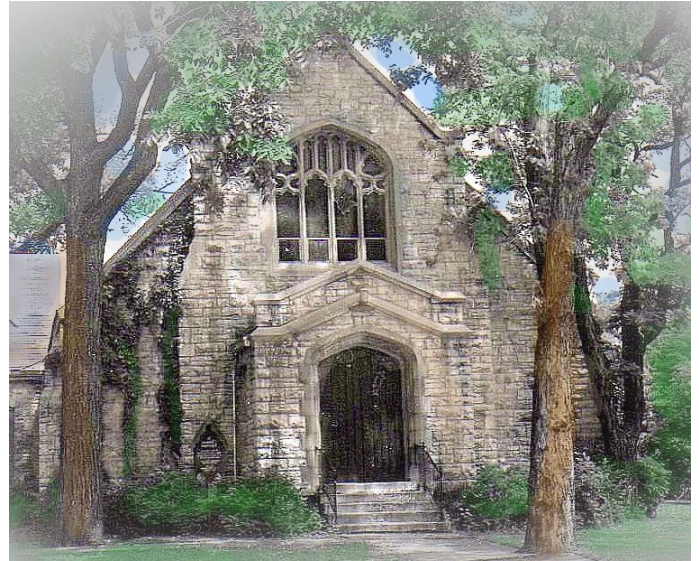
1915 St. Thomas Church

The community of St. Thomas Episcopal Church started its beginning as a family of Christ 164 years ago. St. Thomas has benefitted from the stability that comes with the longevity of ministry. We have had only four rectors in the past 67 years. Many replacements and renovations have led to our current building, an impressive blend of two architectural periods. Its majestic sweeping curved roof resembles a ship under sail and its spectacular copper steeple allows us to bring our thoughts upwards. Preserved stained glass windows and the altar from the original building remind us of the grace of God. Symbols of unity abound and speak to our shared Creed and our Savior.