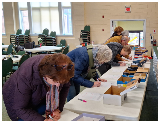
Care packages for college students