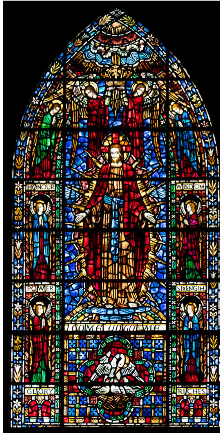
Stained glass over the chapel altar

VISION: We are a Jesus-centered, Spirit-filled community of diverse followers working to transform the world