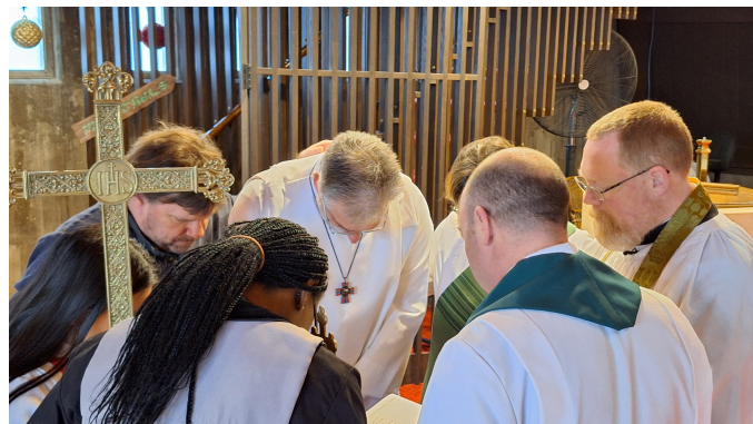
Prayer after a service

St. Thomas is a faithful, passionate community of Christ followers located in Neenah-Menasha, Wisconsin. We draw worshippers from roughly a 50 mile radius (in person) and from many parts of the world (virtual). With active involvement in many diocesan events and leadership positions, we are the largest congregation in the Diocese of Fond du Lac. We are the third largest Episcopal church in the state of Wisconsin.