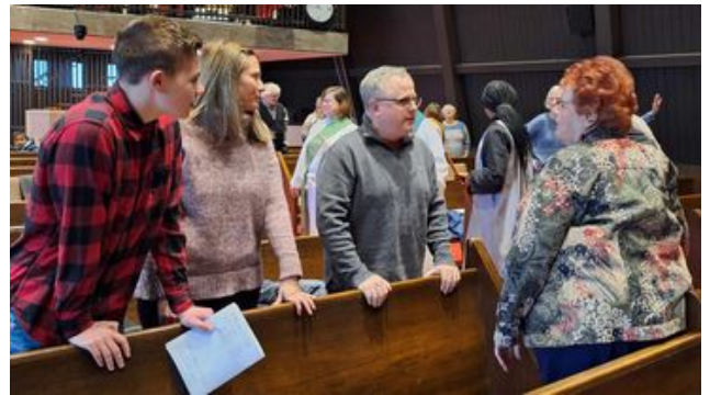
Passing the Peace