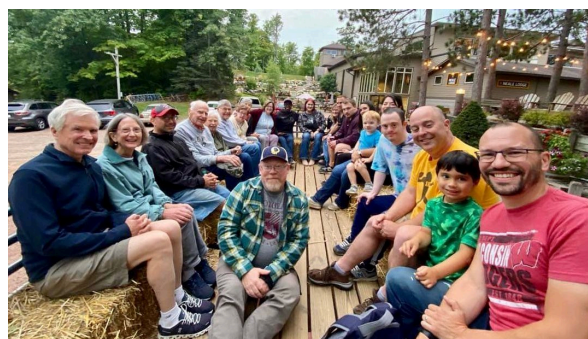
Fellowship Weekend Hayride

You Are Now Entering The Mission Field. God is with You.