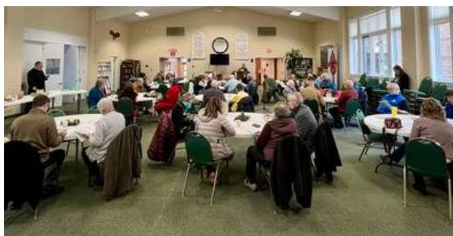
Discussion about our future

The Church is changing, and the culture around us is changing. We look forward to the perspectives and experiences our next Rector will bring to our St. Thomas family. Engaging in the next chapter at St. Thomas is exciting and we hope to bring a willingness to see what God is doing and gracefully develop a partnership with our next Rector that will strengthen the faith and spirituality of our St. Thomas community and our Rector.