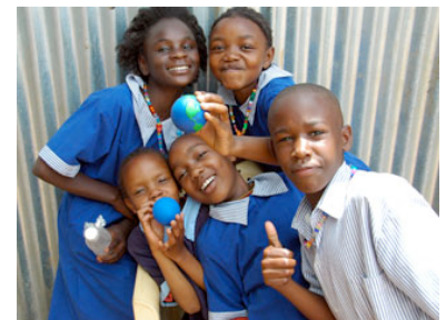
Mother's Mercy Home, Kenya