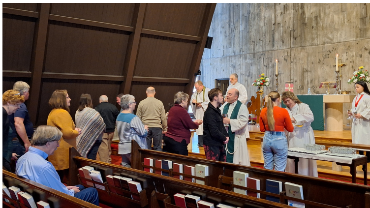
Distribution of Communion