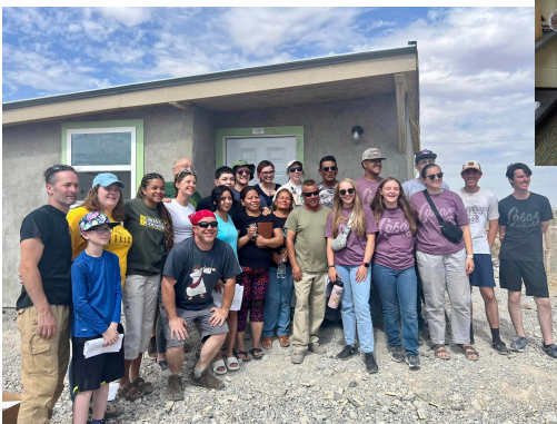
Youth Mission Trip