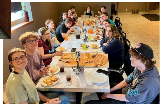
D-Groups (Discipleship for Youth)